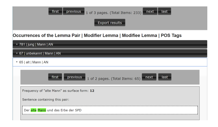
Figure 4: Representation of the search results

Clicking the Export results button lets the user download a .csv file that contains all results from the query and can be used for offline work and further processing steps.